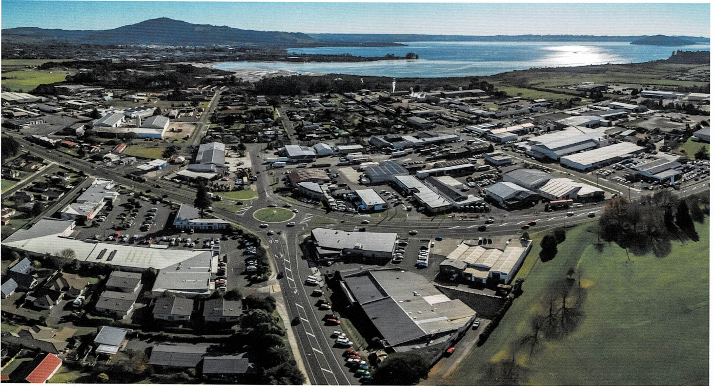
State Highway 30/Te Ngae Road

A lot of work is happening across Rotorua's state highways to create a transport system that is safer, more efficient, and caters to all road users.