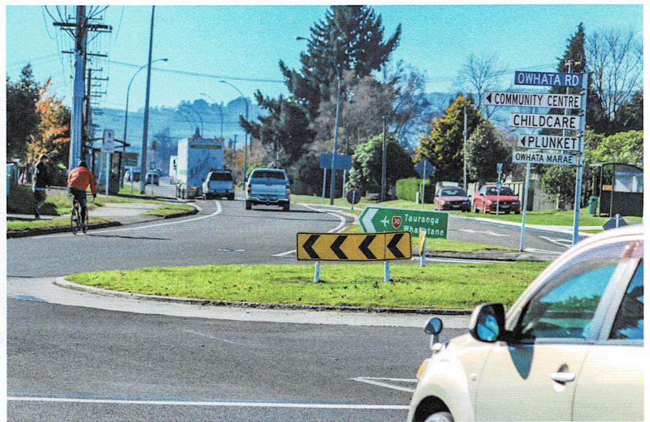
Stage Two looks at the future of the SH30/Owhata Road intersection