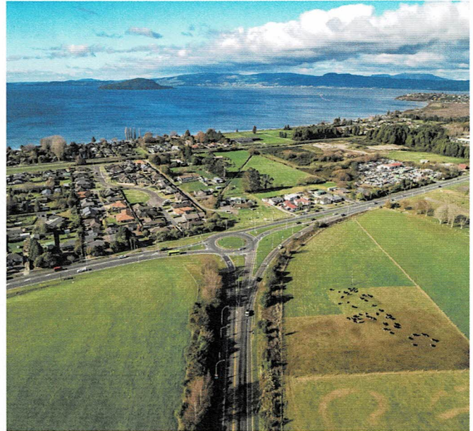
SH5/SH36 Ngongotahā roundabout

We know this area has been a concern for the Rotorua community and we are pleased that the regional package of the NZ Upgrade Programme is combining with the Safe Network Programme to deliver improvements. We are currently confirming the design and will be communicating this back to the community and our stakeholders in the coming months.