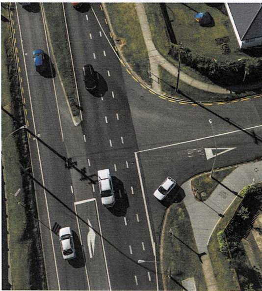
SH30/Brent Road intersection

We'll be coming back to the community to share more information about this project soon.